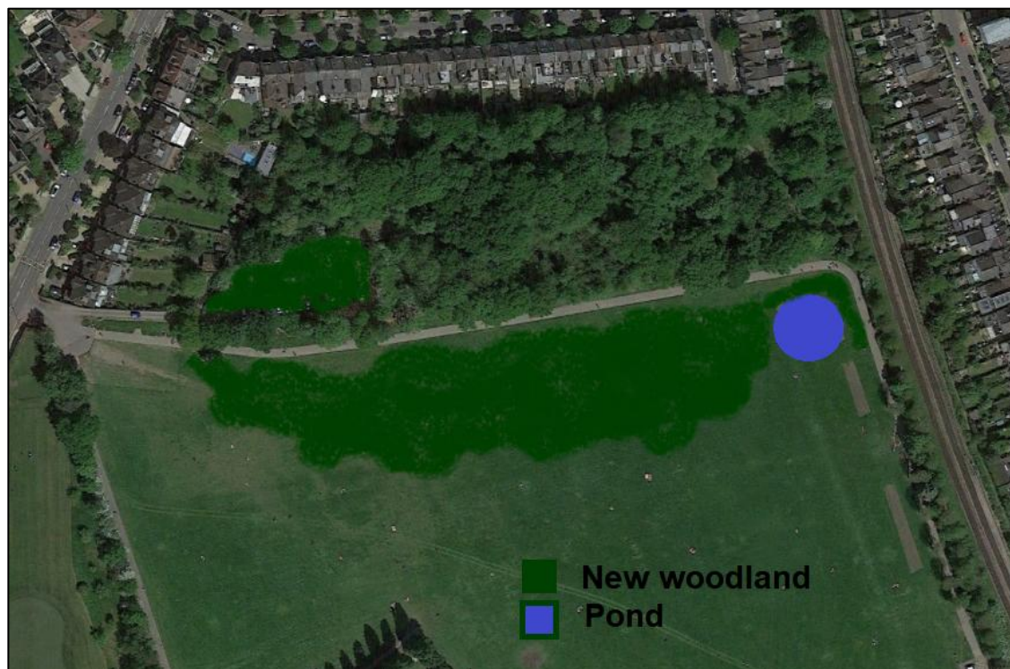
Figure 1. Indicative new planting on the car park and Great Field

National and local policy is that the wood should be enlarged. A range of species suitable for this is appended, and these will be supplemented by natural colonisation. As a precaution against changing climate, such colonisation is encouraged. Any planting stock should be UK and Ireland Sourced-and-Grown-Assurance (UKISG-A) to minimise the risk of importing new pests and diseases.