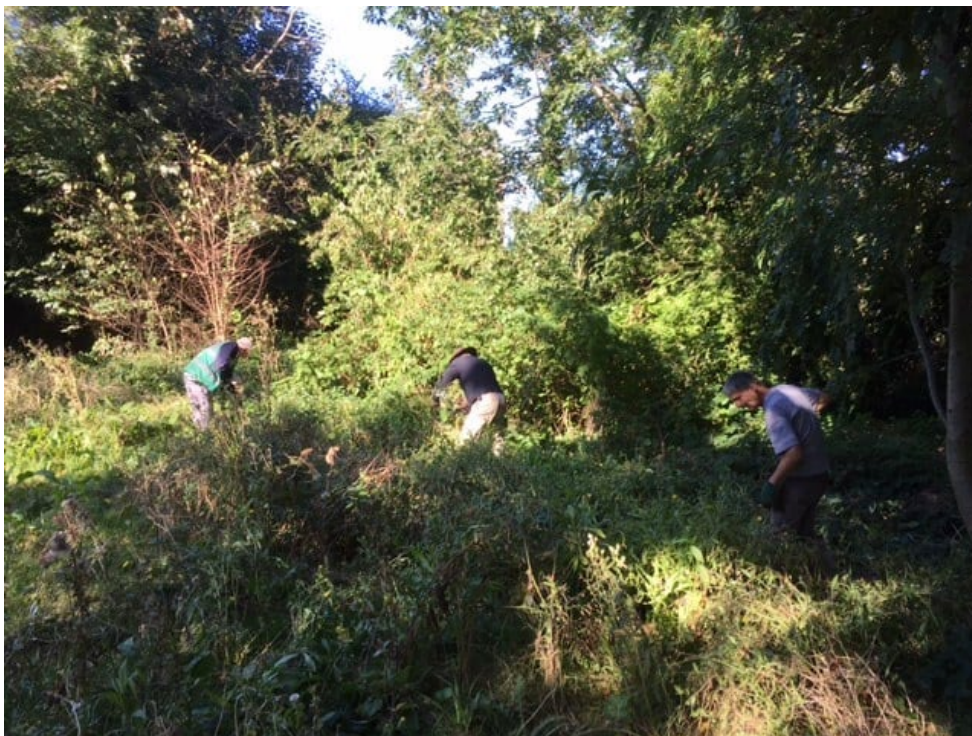
Tackling the overgrowth!

Our thanks to members/volunteers who did sterling work in the meadow in Horse Close Wood recently. Armed with shears, secateurs, forks and a scythe they cut and strimmed parts of the glade as the bramble 'invasion' was becoming a little overwhelming! They collected two crane bags of brambles and tree branches which were moved to the log area to deter anti social gatherings in the wood at night. The work has now been completed – lets see what grows there next year!